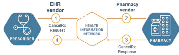
Figure 1. CancelRx transaction process.

However, despite having been available since 2010, this transaction is an optional functionality for both EHR systems and pharmacies and was not explicitly incentivized by Meaningful Use, and thus has experienced low adoption and suboptimal utilization. The low adoption by EHR systems and pharmacy systems is perhaps justly attributable to hesitancy from each side until a critical mass of adoption by the other justifies the substantial implementation efforts to reach full realization of CancelRx's benefits. Due to the lack of end-user knowledge and the technology implementation gap for intended functions, some prescribers may opt to utilize elements in NewRx messages instead of the specific CancelRx message to communicate orders for discontinuation or alteration of medication regimens.