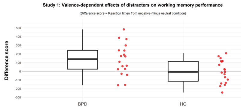
Figure 1. Separate boxplots and individual results of response latencies for trials with negative distracters controlled for response latencies to neutral stimuli for patients with BPD and healthy controls.

(rated from 1 - very negative to 9 - very positive) were M = 5.01 , SD = 0.35 for neutral stimuli, and M = 2.33 , SD = 0.42 for negative stimuli. Arousal ratings (rated from 1 - not arousing at all to 9 - highly arousing) were M = 3.75 , SD = 0.86 for neutral stimuli, and M = 5.86 , SD = 0.82 for negative stimuli. Neutral and negative stimuli were matched with regard to luminance and visual complexity as determined from jpeg size in bytes (all p 's > 0.40 ) 37 .