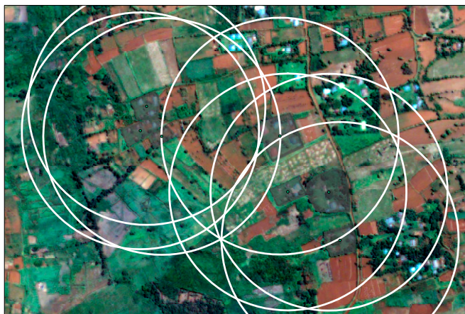
Fig. 3. The single-level approach to linking satellite and household data often uses a single radial buffer zone. This can be problematic as it results in overlapping regions and multiple pixels being assigned to multiple households when households would not have access to some land parcels such as multiple homesteads.

Tree regression allows for complexities to be identified in the relationships between wealth and RS variables. Households characterized by large building sizes had a lower proportion of bare agricultural land and a lower proportion of planted agricultural land at the start of the second planting season. Wealthier households derived 71% of their incomes from nonagricultural sources (23). Therefore, the results may indicate that these households do not need to plant second crops during the short rainy season. Poorer households were characterized as having more bare land within the agricultural fields (level 2) in September, which means