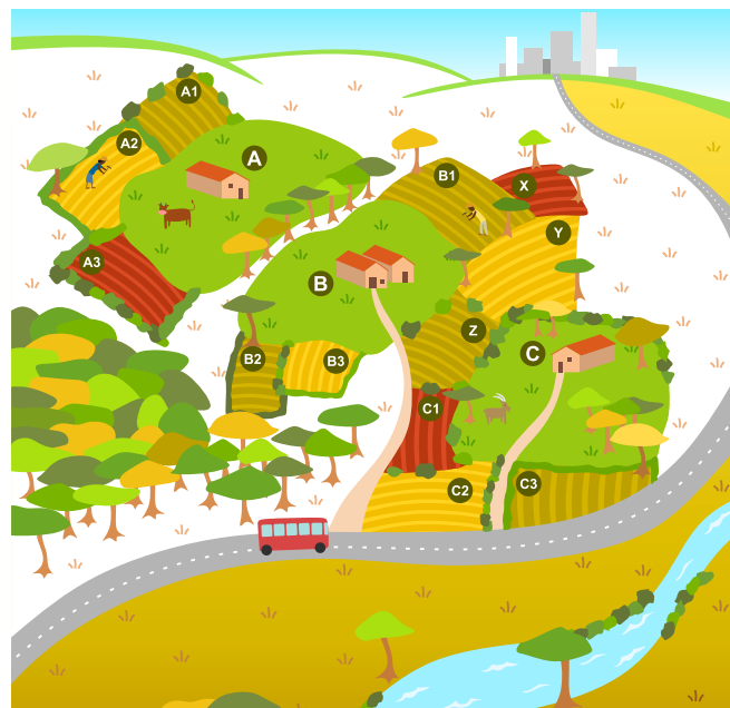
Fig. 1. The multilevel approach to linking households and landscape characteristics. Households have individual access to homestead areas (A, B, and C: level 1) and agricultural fields (A1–A3; B1–B3, C1–C3: level 2) surrounding the homestead. These levels should be linked to a single household. Households will also make use of common pool resources (level 3) around the village, which can be linked to multiple households. The wider regional level (level 4) considers infrastructure access. X, Y, and Z indicate fields that are adjacent to multiple households or no households, which would be split using our current method.

The poorest households were characterized by a small building size (level 1), a relatively large proportion (almost half) of bare agricultural land in level 2 and bare ground in level 1 (Fig. 2). If a household had less than 43% bare ground within the homestead area, but with less than 163 growing days in the year, it was classified in the poorest household category. Poor households that had a large building size (37/92) had less than 21% of the agricultural land planted in September, but experienced over 6 y of below-average growing periods during the 14-y time series of Normalised Difference Vegetation Index (NDVI) and had over 16% of the common pool resource buffer (level 3) covered in homestead areas. Overall, 60% (55 households of a total of 92) of group 1 households, 31% (29 households of 92) of group 2 households and only 9% of group 3 households had a building size under 140 m 2 .