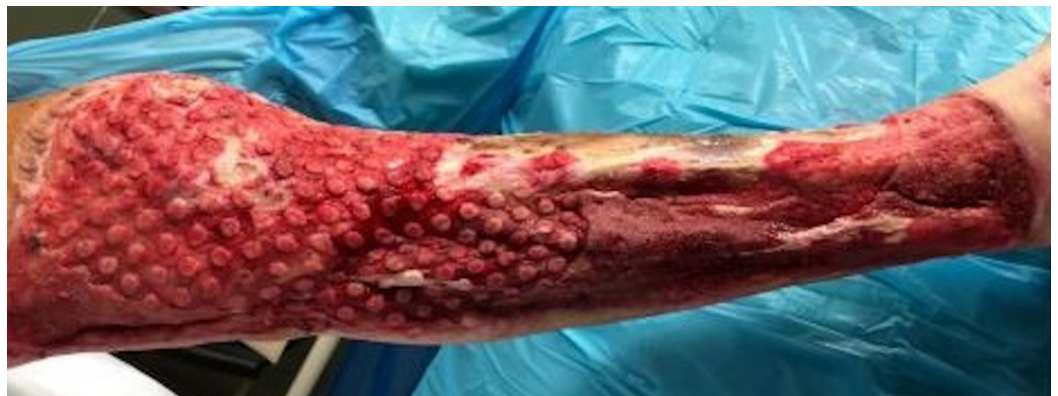
FIGURE 12: Followed by the appearance of the classic VVCC comedones granulation tissue after the multiple debridements and applications of the VVCC device