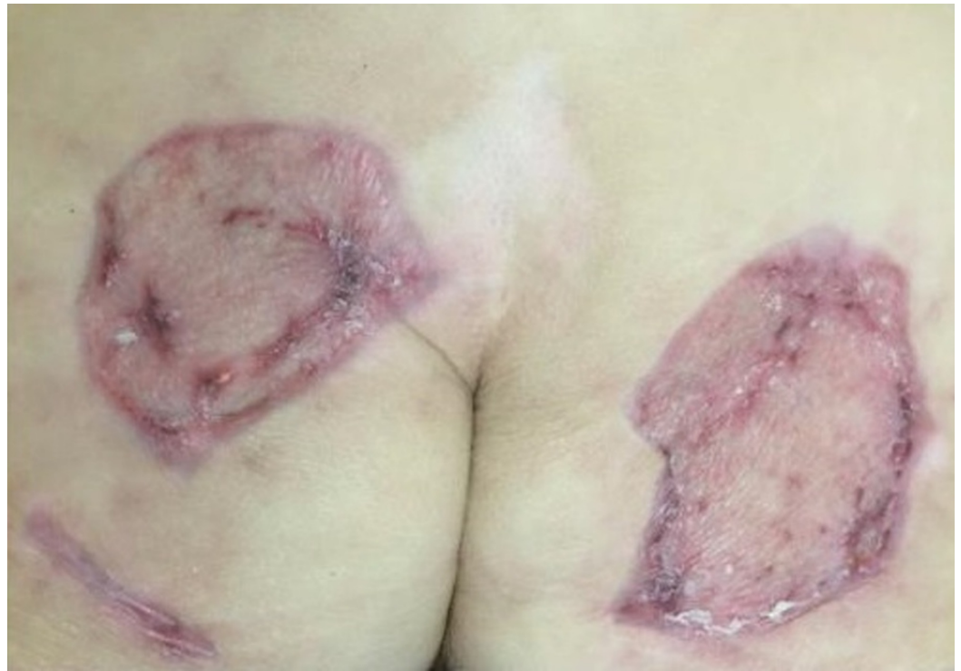
FIGURE 8: Closure of the bilateral buttock wounds after standard split-thickness skin grafting techniques