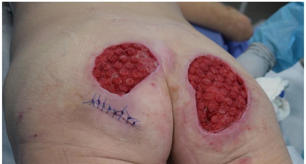
FIGURE 7: Afterburn wound eschar debridement and several days of VVCC, appearance of the classic VVCC “comedone” development with increased granulation tissue within the ROCF hole boundaries

VVCC: V.A.C. VERAFLU CLEANSE CHOICE™; ROCF: reticulated open cell foam dressing