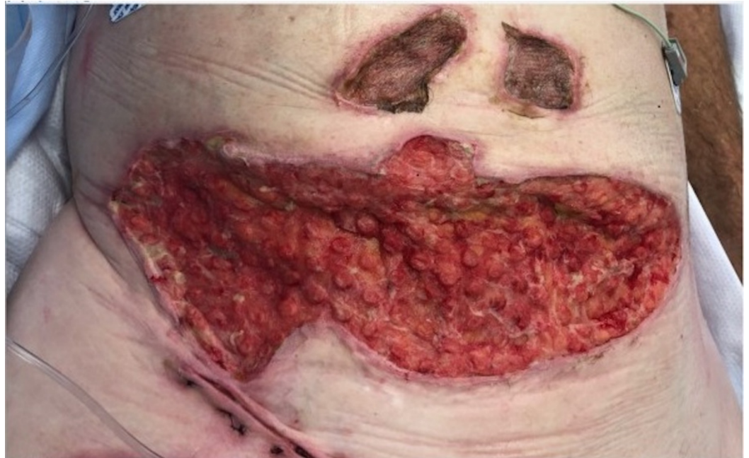
FIGURE 11: Followed by the appearance of the classic VVCC comedones granulation tissue