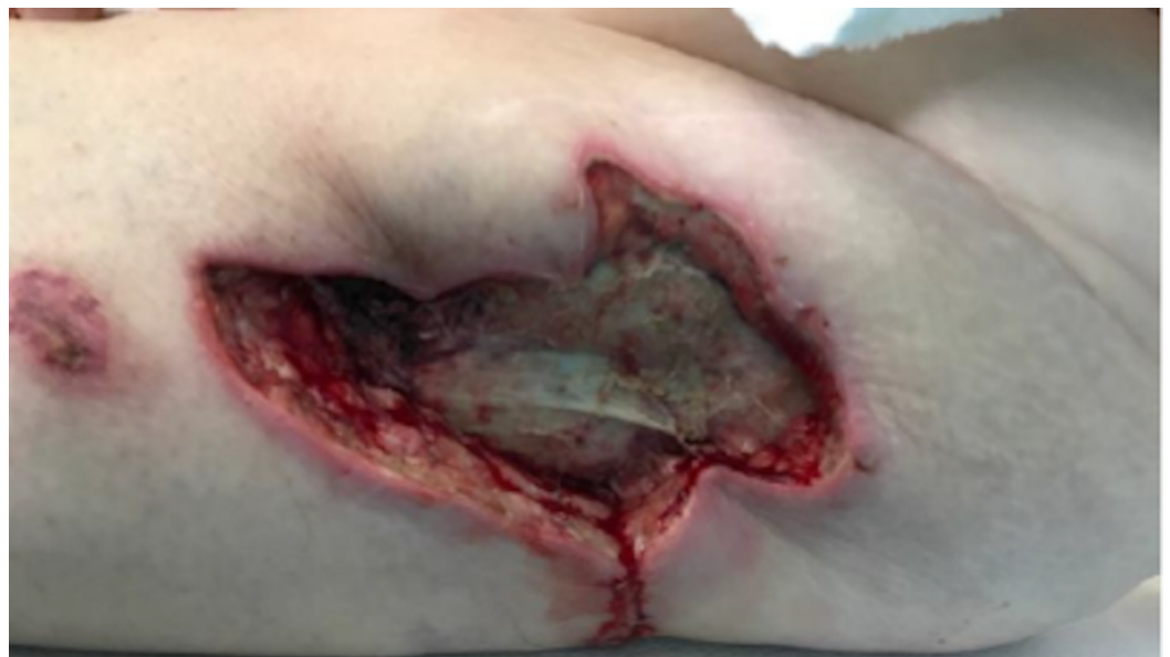
FIGURE 1: Initial debridement of burn eschar revealing deep necrotic tissue still in place

A 77-year-old male was admitted for contact burns to the bilateral lower extremities and over the left hip, involving not only the skin but a burn injury down to the fascia and muscle. The patient had multiple medical comorbidities, including diabetes mellitus and hyperlipidemia. After debridement and dressing changes (Figure 1), attempts at grafting the site with split-thickness skin grafts (meshed 2:1, 150 sq cm) resulted in graft loss within days, secondary to an inadequate depth of debridement and the lack of appropriate granulation tissue presence. Therefore, the patient was transitioned into VVCC NPWT to assist in irrigation debridement, granulation tissue formation, and wound contraction with the addition of Vashe® instillation at 30 ml for 20 minutes duration every three hours before returning to suction for over two weeks. NPWT suction was maintained at 125 mmHg while on suction. Rapid improvement in wound granulation tissue formation was noted (“comedones” or discrete and increased granulation tissue within the ROCF hole boundaries, Figure 2). The patient continues to follow up in our clinic with planned skin grafting at the time of this manuscript’s submission.