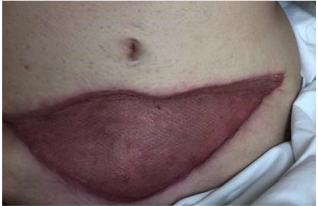
FIGURE 17: Lower abdomen following completion of therapy and skin grafting

and development of comedone granulation tissue around a small area of remaining fibrinous exudate