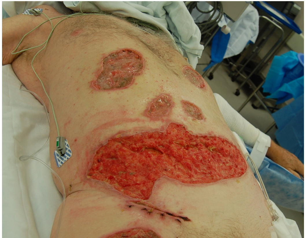
FIGURE 9: Initial debridement of an abdominal burn eschar