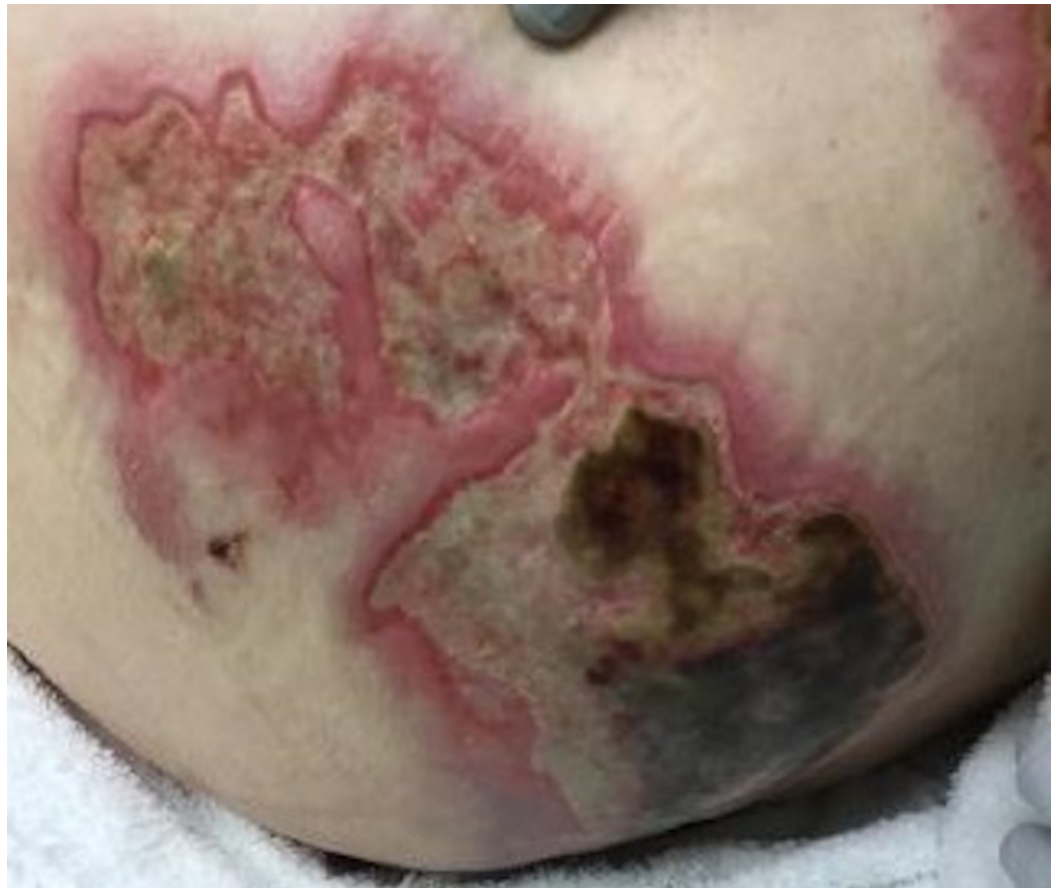
FIGURE 3: Initial third-degree burn wounds to the patient's left buttocks and hip