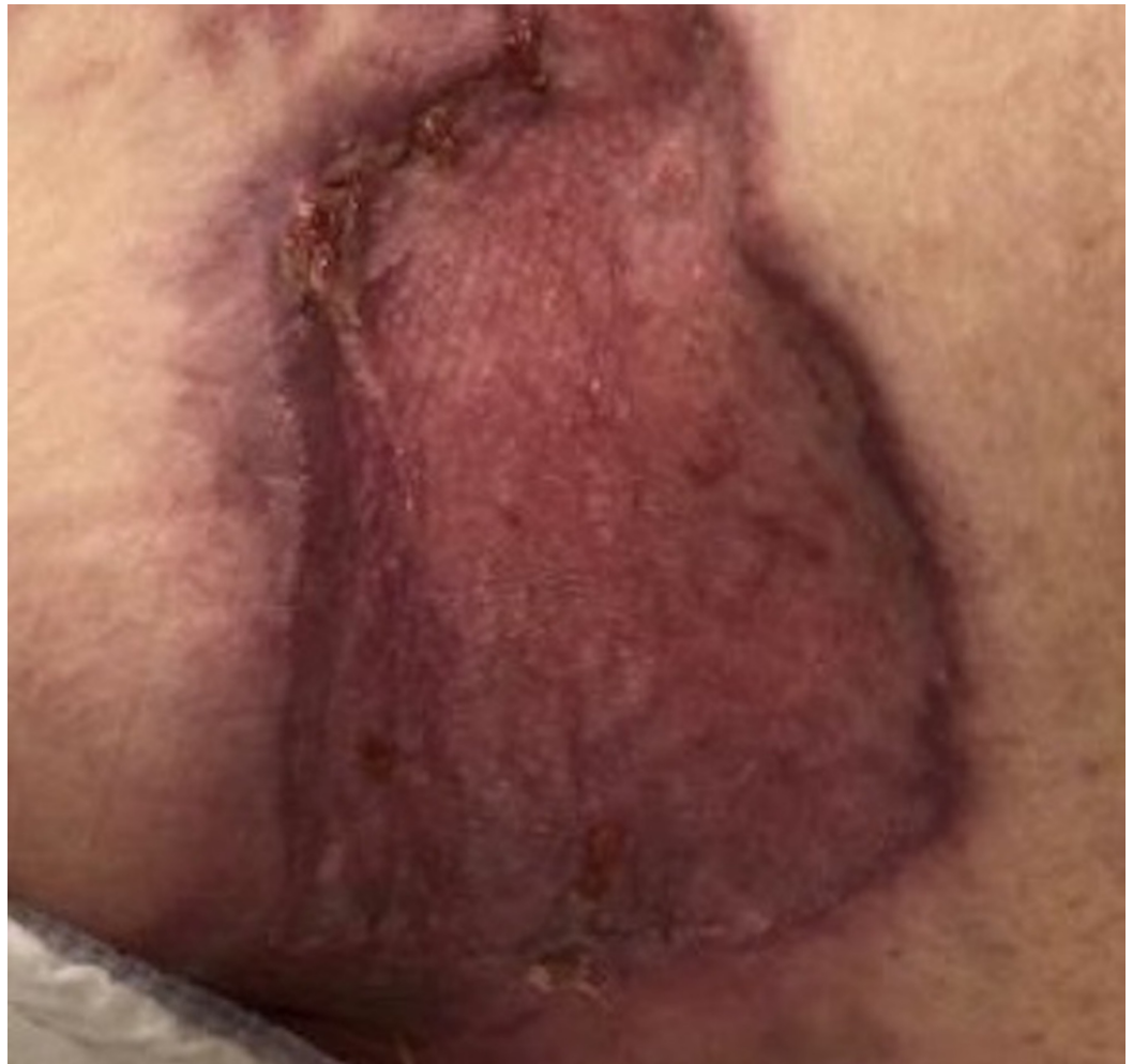
FIGURE 5: Closure of left buttock and hip wounds after standard split-thickness skin grafting techniques