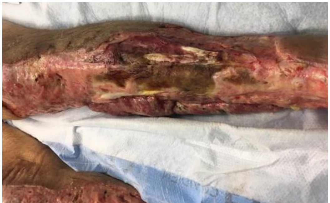
FIGURE 10: Initial left leg burn eschar