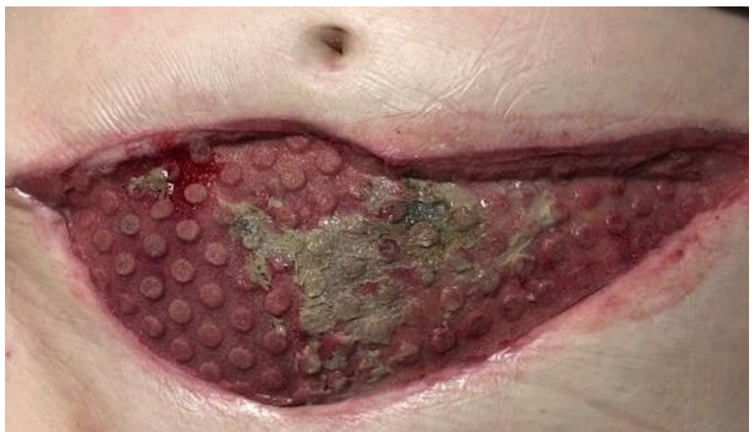
FIGURE 16: Contraction of the large anterior abdominal wound