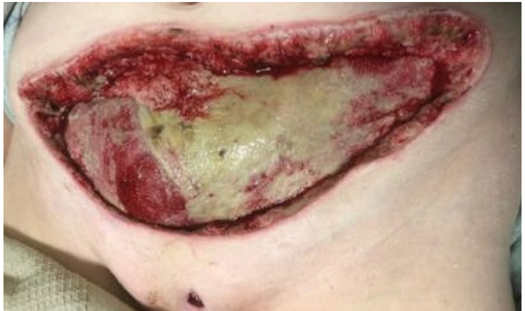
FIGURE 15: Large anterior abdominal wound after serial debridements

necrotizing fasciitis due to an infected subcutaneous insulin pump. The patient underwent extensive debridement down to the rectus fascia and was left with a large soft tissue defect (Figure 15). The patient had placement of the VVCC NPET once the wound was debrided to viable tissue and the initial infection was controlled. The wound has been granulating and contracting with V.A.C. VERAFLU CLEANSE CHOICE™ also utilizing HOCl instillation of 30 ml with a dwell time of 20 minutes every three hours and then returning to a negative pressure of 125 mmHg. Because of the patient's multiple medical issues and compromised immune system that would normally impair wound healing, the patient is weeks away from wound closure (Figure 16). The patient's therapy was completed with the closure of the wound following split-thickness skin grafting (Figure 17).