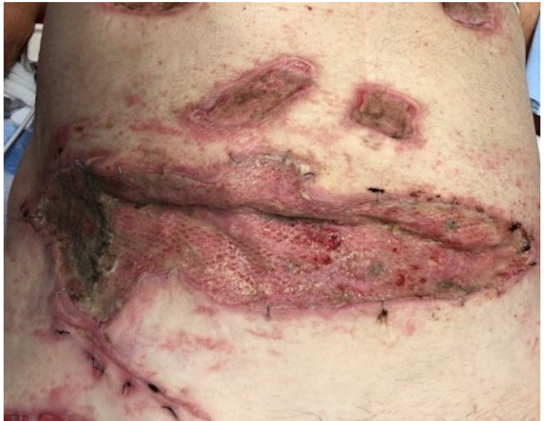
FIGURE 13: Finally, closure of the abdominal wound with split-thickness skin grafts