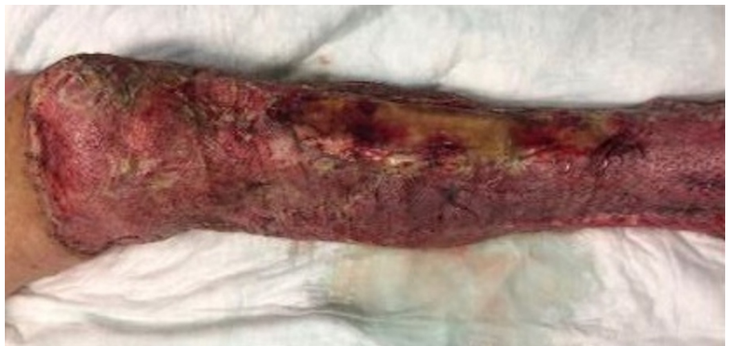
FIGURE 14: Subsequent closure of the left leg wound with split-thickness skin grafts