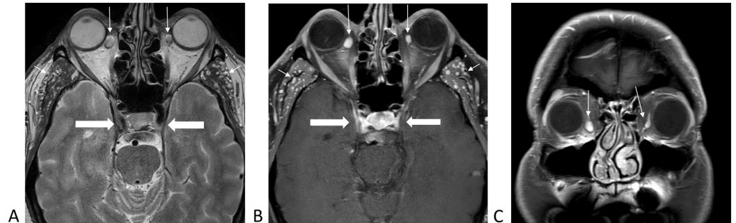
FIGURE 1: Magnetic resonance imaging of the brain demonstrating varices of inferior ophthalmic veins bilaterally (long arrows), infratemporal venous vessels (short arrows), and normal cavernous sinuses (thick arrows).

Diagnostic work-up included laboratory testing and magnetic resonance imaging (MRI) of the brain and orbits with and without contrast. This work-up was prompted by the history of chorioretinal scarring and blurry vision in the past requiring treatment. Laboratory workup was negative aside from positive toxoplasma IgG antibodies. MRI of the brain and orbits with and without contrast revealed varices of the bilateral inferior ophthalmic veins, bilateral pterygoid plexuses, and the infratemporal veins. There was no dilation or thrombosis of the superior ophthalmic veins, and no abnormal enhancing mass lesions within the orbits or brain parenchyma. No intracranial arteriovenous malformations, dural fistulas, or carotid cavernous fistulas were identified (Figures 1-3).