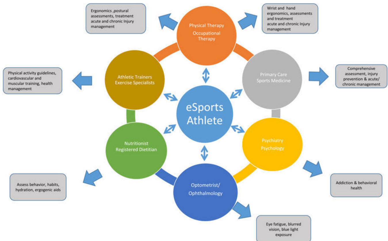
Figure 2 eSport health team model.

Overall, eSport players face challenges to master their gaming while addressing adverse repercussions on their health. Currently, the NCAA does not recognise eSport