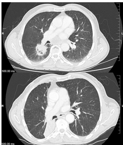
Figure 1 Ultracentral tumor before and after stereotactic body radiotherapy. Treatment of an ultracentral tumor which was abutting the right proximal bronchus. Stereotactic body radiotherapy was delivered to the tumor with a dose of 60 Gy in 8 fractions. The inferior image was taken two years following SBRT, demonstrating post radiation fibrosis/atelectasis.

toxicity profiles between peripheral, central or ultracentral tumors (27). Put together, there does not appear to be a difference in survival or control rates with ultracentral tumors with SBRT, but greater concerns remain regarding the toxicity profile. Figure 2 demonstrates a treatment plan of an ultracentral tumor, using a definition of PTV overlap with the proximal bronchi.