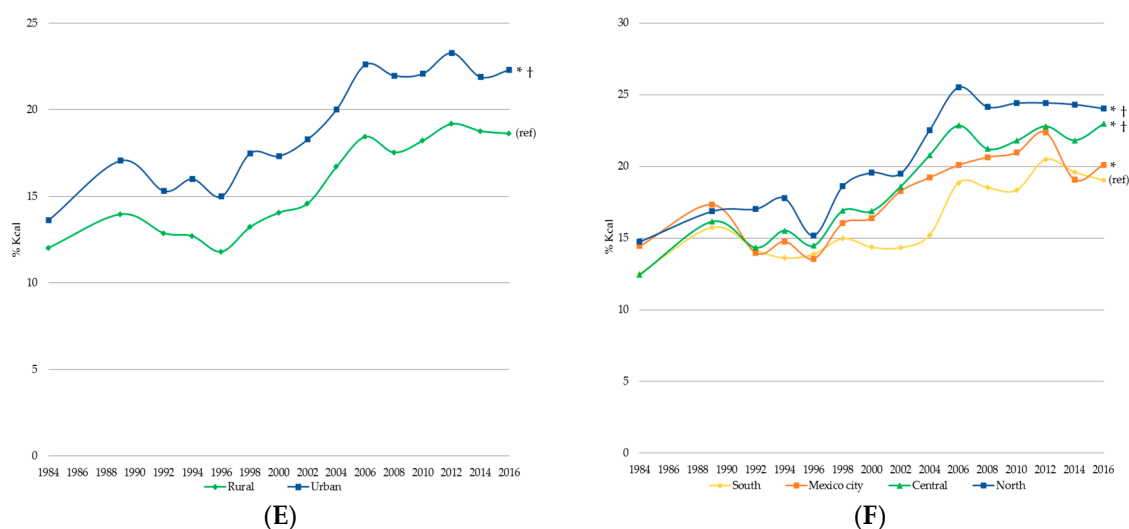
Figure 2. Trends in daily energy purchased contribution of ultra-processed foods stratified by (A) household composition, (B) head of household educational level, (C) household women’s occupation, (D) household income, (E) residence area and (F) region (ENIGH 1984–2016). Adjusted by household size and all other variables presented in the figure. * Value in 2016 was different ( p < 0.05 ) vs. value in reference category. † Change from 1984 to 2016 was different ( p < 0.05 ) vs. change in reference category.