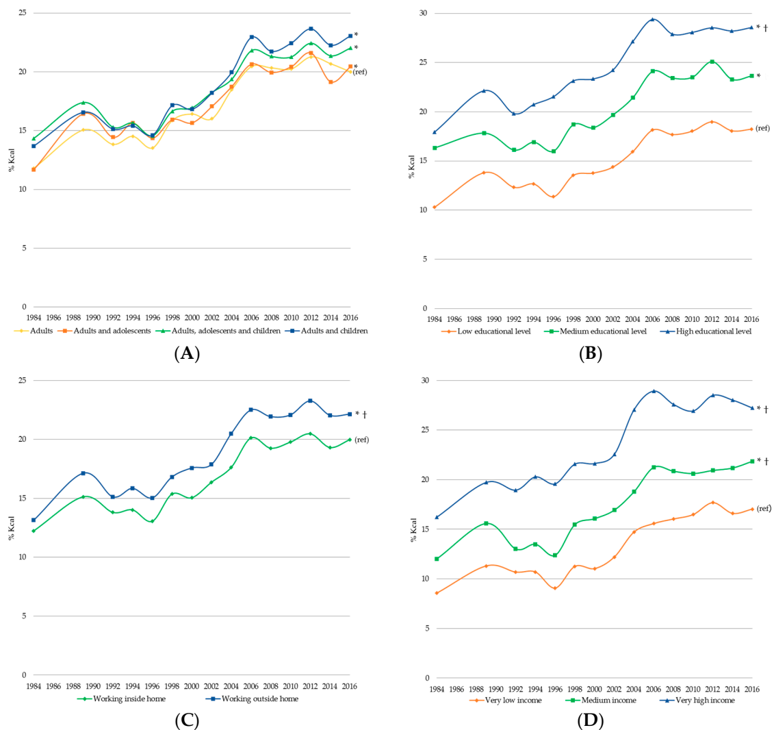
Figure 2. Cont.

Figure 2 shows the trends in the daily energy purchased contribution of ultra-processed foods by sociodemographic characteristics from 1984 to 2016 adjusted by all other sociodemographic characteristics. We observed that the energy purchased contribution of ultra-processed foods in 2016 was higher ( p < 0.05 ), and the change from 1984 to 2016 was larger ( p < 0.05 ) in: Households in which the head of the family had a high educational level compared to those in which the head of the family had a low and medium educational level; households where the women work outside the home compared to those in where the women work inside the home; households with medium and very high socioeconomic status compared to those with low socioeconomic status; households from urban areas compared to those from rural areas; and households from the central and north region compared to those from the south region. On the other hand, there were no differences in the change from 1984 to 2016 among the households with different composition. However, we observed that the energy purchased contribution of ultra-processed foods was higher ( p < 0.05 ) in 2016 in household with adults and adolescents, adults, adolescents and children, and adults and children compared to those with adults only.