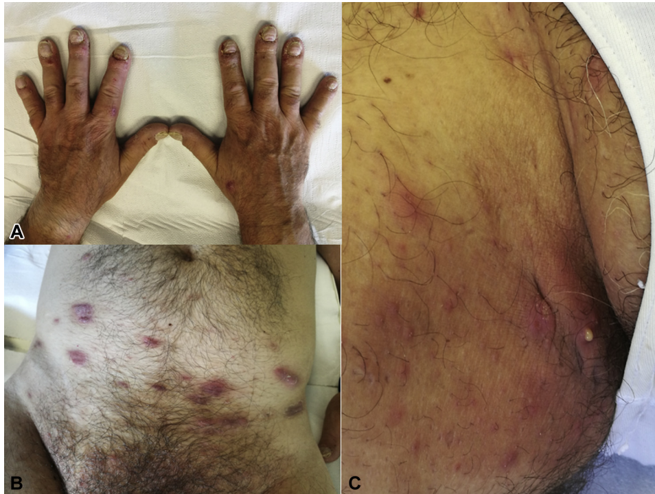
Fig 2. Patient 2. A , Psoriasis skin lesions confined to dorsal aspects of both hands, particularly on periungueal area and nails. B and C , Presence of multiple erythematous nodules and papules, as well as some abscesses, localized at axillary, inguinal, and abdominal area.

secukinumab and adalimumab can be drawn. Nevertheless, adalimumab is approved for HS and psoriasis treatment, and paradoxical cases of HS or psoriasiform eruption induced by this anti-tumor necrosis factor (TNF)- \alpha are described in literature. 8 Particularly, a multicenter nationwide retrospective study was recently published reporting a paradoxical HS under biological agents with adalimumab being responsible of 48% new HS onset cases. 9 An imbalance in cytokine production, an unopposed type I interferon production, and a shift toward a helper T cell 1/helper T cell 2 profile may play a role. Particularly, for psoriasiform eruptions, it is hypothesized that TNF- \alpha inhibition may stimulate increased maturation of plasmacytoid dendritic cells with uncontrolled production of interferon- \alpha , favoring T-cell homing to the skin and activation of T cells to produce TNF- \alpha and IL-17. 10 This finding may explain the efficacy of anti-IL-17 on the psoriasiform eruption observed in our HS patient, as increased IL-17 levels in HS skin and serum justify anti-IL-17 efficacy in HS lesions too. On the other hand, hypotheses to explain the occurrence of HS under anti-TNF- \alpha are scant: local modification of cytokine balance and activation of alternate pathways such as interferon type I or IL-1 \beta have been advanced, together with a potential favoring action on occult infection, which is a well-known