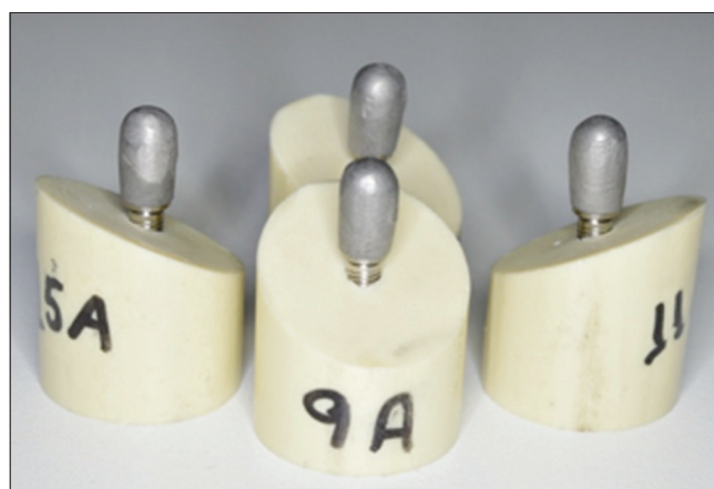
Figure 4: Copings positioned and temporarily cemented onto the Pilar Flex abutment.

in vitro at a dry place, room temperature ( 24^{\circ}\text{C} \pm 1^{\circ}\text{C} ), with 53\% \pm 1\% humidity. [11]