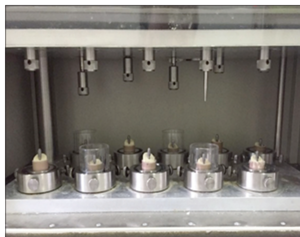
Figure 5: Image of the specimens positioned in the cycling machine.

In this study, the null hypothesis was rejected since there was a significant difference ( P < 0.001 ) in the