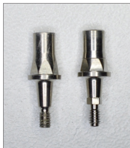
Figure 2: Left: Nonindexed Pilar Flex Morse Taper abutment. Right: Indexed Pilar Flex Morse Taper abutment.

All tests were conducted at the Material Testing Laboratory of ICT-UNESP, Dentistry School (University of São Paulo) in São José dos Campos,