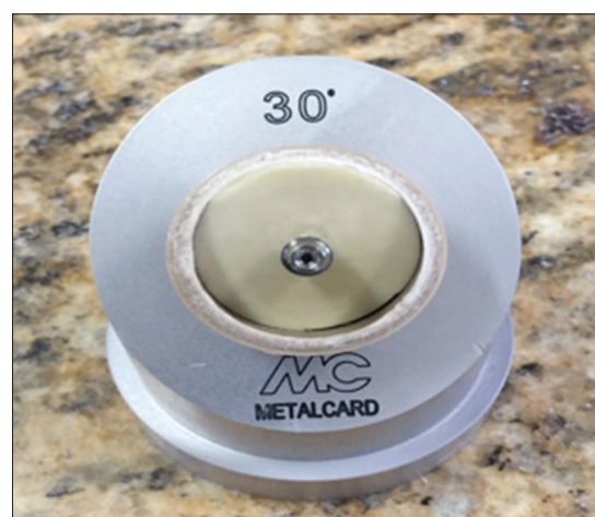
Figure 3: Implant installed in the polyurethane resin and placed on a surface with 30° inclination as per ISO 14801/2007 protocol.