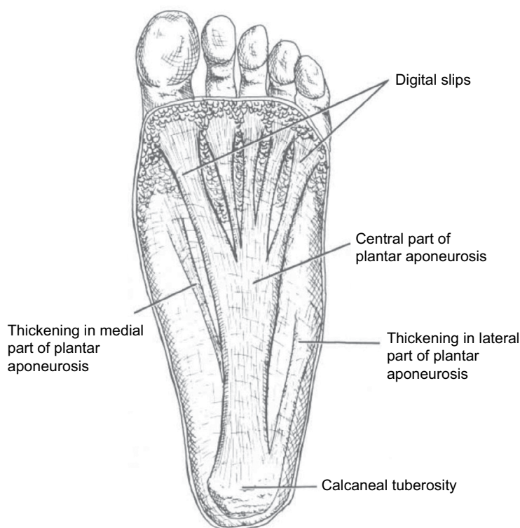
Figure 1 Anatomy of the plantar fascia.