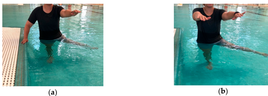
Figure 1. (a) Level 1 Exercise: Standing with support hand support from the wall, wide-base foot stance, lifting one foot from the pool base at a time. (b) Level 2 Exercise: Same as Level 1, but no external support.

Finally, this paper attempts to offer suggestions for hydrotherapy exercise prescription for elderly individuals based on adaptations of research contributions from Oddson et al. in hydrotherapy, which provides five levels of training protocols that gradually progress in intensity and complexity of the exercises performed [28,29]. An instruction type exercise protocol for these five levels, based on adaptations from Oddson et al. [28,29] are provided in figures (Figures 1–3) and table (Table 1). As such, these hydrotherapy prescriptions can be used as suggested protocols in an elderly population in an attempt to reduce falls and fall-related injuries.