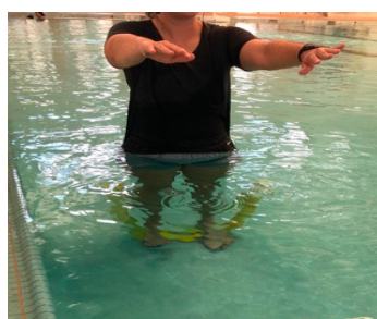
Figure 3. Level 5 Exercise: Similar to level 4 but while standing on noodle, shifting base of support, while opening/closing eyes, adding cognitive tasks.