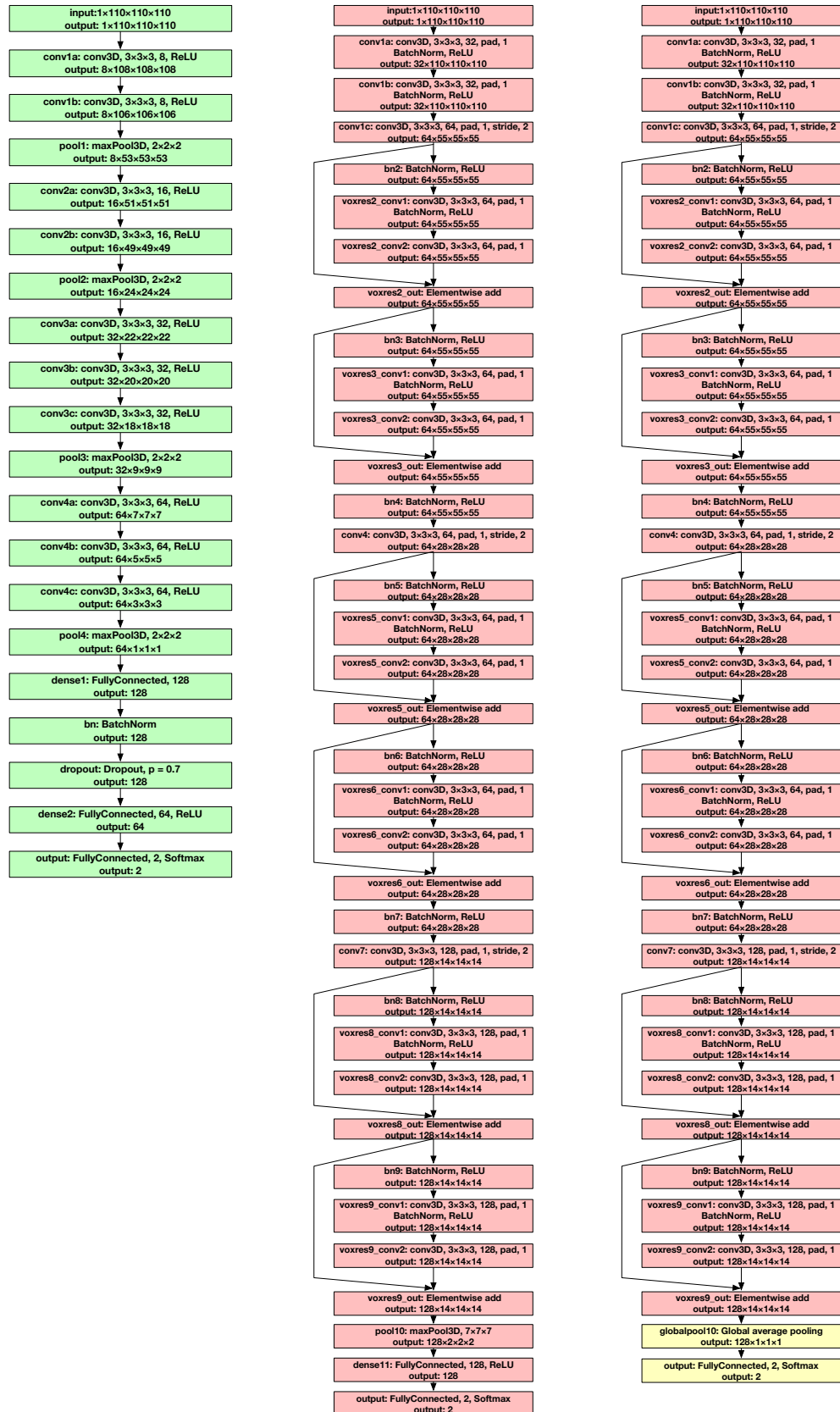
Figure 1: Left: The architecture of 3D-VGGNet; Middle: The architecture of 3D-ResNet; Right: The modified architecture of 3D-ResNet with global average pooling layer, 3D-ResNet-GAP, to produce 3D class activation mapping (3D-CAM). The only difference is that a global average pooling layer directly outputs to the softmax output layer (yellow boxes), replacing the original max pooling and fully connected layers.