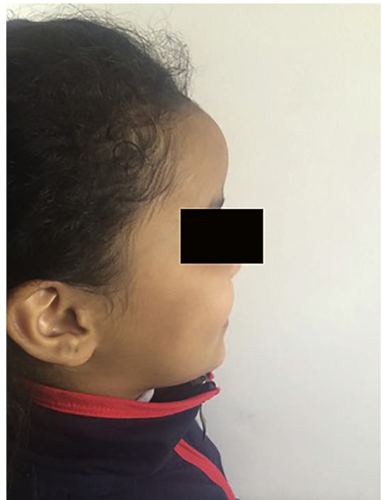
Figure 2 Lateral view of Fluctuant firm swelling over the right frontal area with mild right periorbital swelling.

periorbital swelling (Figs. 1 and 2). Normal pupillary reflexes and extra-ocular eye movements were intact. There were no meningeal signs that were elicited, and no neurological deficits were present.