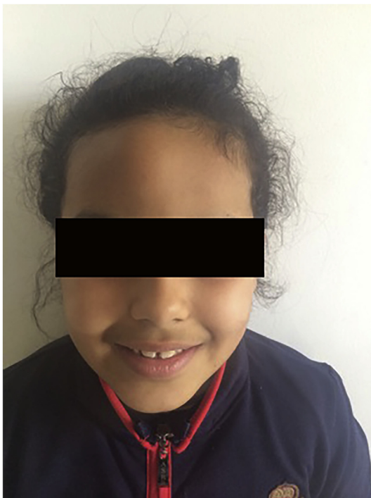
Figure 1 Frontal view of fluctuant firm swelling over the right frontal area with mild right periorbital swelling.

Upon examination, she had an undulating erythematous firm swelling over the right frontal area with mild right