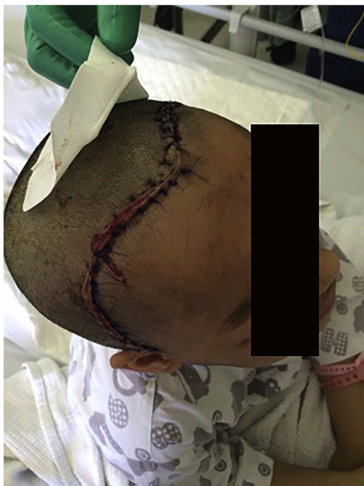
Figure 4 Post functional endoscopic sinus surgery (FESS) and craniotomy with flap to repair the defect.

Pott's puffy tumor is a very rare condition and nothing from previously reported cases detailed fungal species as a causative agent. However, the most commonly cultured organisms in PPT are Streptococci , mainly Streptococcus milleri which was found in approximately 50% of the reported cases, Staphylococci , anaerobes, namely Fusobacterium and Bacteroides , and less commonly Proteus and Pseudomonas [11,19–23]. In our case, the surgical culture from the frontal bone grew A. fumigatus , which is abnormal to have grown as a fungal organism in an immunocompetent individual.