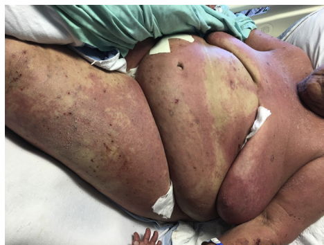
Fig 1. Infiltrated erythematous plaques covering greater than 50% body surface area with erosions and excoriations.