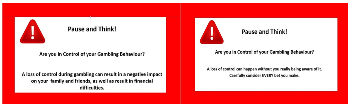
Figure 4. Emotive pop-up message (left) and informative message (right). Pop-up message was presented after 30 gambling trials, interrupting play for 30 s before allowing the gambling simulation to continue

Mean participant trait impulsivity scores were assessed using the BIS-11 (Patton et al., 1995). A between-participants analysis of variance (ANOVA) showed that participants' overall BIS-11 scores [ F(4, 69) = 0.149, p = .963 ], including the second-order factors motor impulsivity [ F(4, 69) = 0.801, p = .529 ], attentional impulsivity [ F(4, 69) = 0.924, p = .455 ], and non-planning impulsivity [ F(4, 69) = 0.141, p = .966 ], did not differ between groups to a statistically significant degree. In addition, a between-participants ANOVA showed that participants' mean ages did not differ to a statistically significant degree between experimental groups [ F(4, 69) = 0.348, p = .844 ].