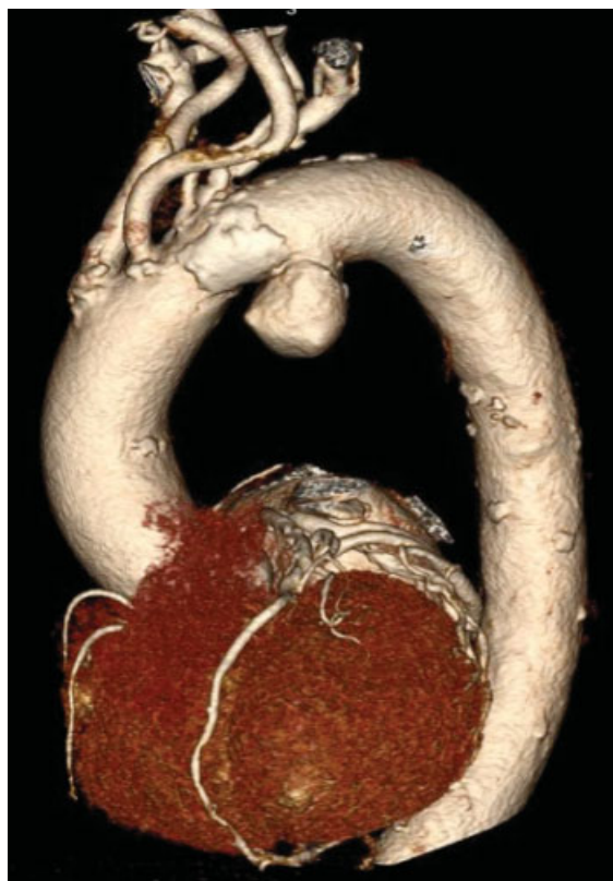
Fig. 1 Three-dimensional reconstruction computed tomography angiography of the aortic arch showing a 5.5 cm saccular arch aneurysm. Note the location of the aneurysm—where the ligamentum arteriosum attaches to the aorta. The left vertebral artery (LVA) comes off the aorta just before the left subclavian artery. LVA was not revascularized in this case as the patient was found to have a dominant right vertebral artery and patent basilar artery.

its original delivery system and one of the 3-nitinol wires withdrawn from the cannula and used as a diameter-reducing wire (►Fig. 2A–C). The constraining process was performed as described by Oderich. 7,8