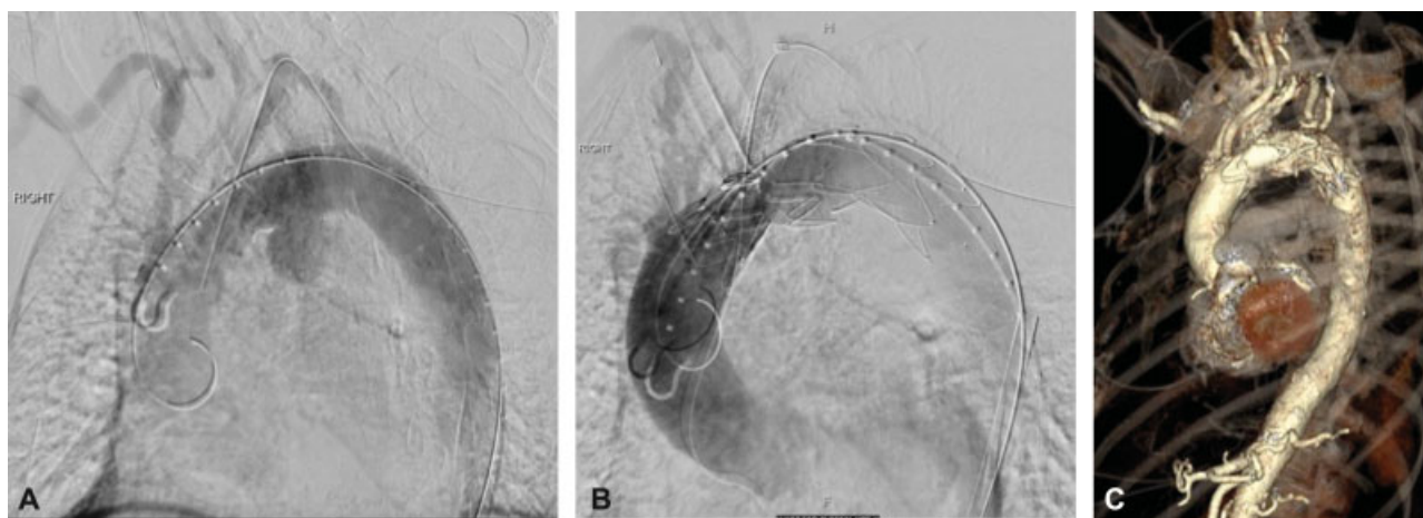
Fig. 4 (A) Diagnostic angiography showing the saccular aneurysm and great vessels. (B) Completion angiography showing exclusion of the aneurysm with excellent perfusion of the target vessel and other great vessels. (C) Postoperative three-dimensional reconstruction computed tomography angiography showing exclusion of the aneurysm with patent arch vessels.

The use of SMFSG for the treatment of complex abdominal and thoracoabdominal aneurysms has been extensively reported. 14 The most commonly used platform for this purpose, Cook TX2, has been discontinued and replaced by the LPSG. The proximal piece of this device comes with protruding barbs that make retrograde resheathing post modification impossible without cutting these barbs—a process that often leads to compromised device integrity and a high incidence of type IA endoleak. The technique described herein allows one to safely modify this device without cutting proximal barbs.