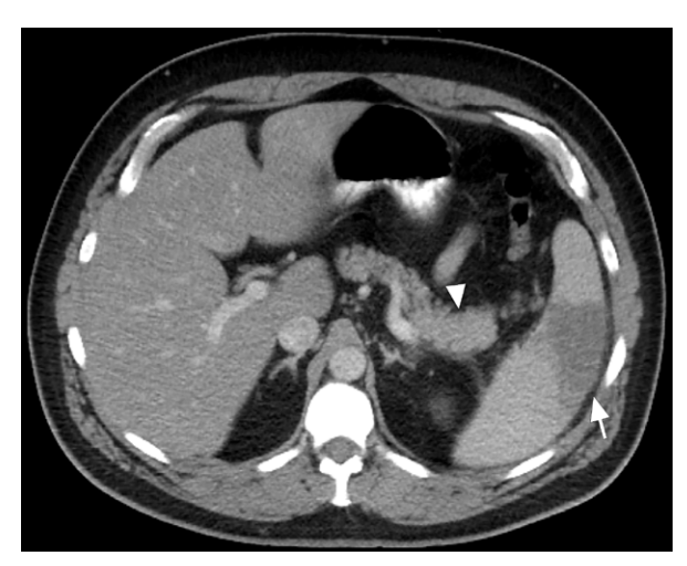
Fig. 1 Abdominal computed tomogram upon admission shows focal pancreatic inflammation (arrow) and concomitant splenic infarction (arrowhead).