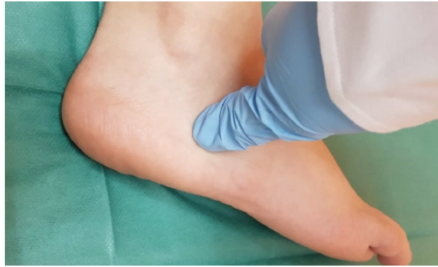
Figure 3 Local tenderness to direct palpation of the cuboid bone following foot injury may suggest cuboid fracture.

complex high-energy injuries involving complex fractures with significant displacement and intra-articular involvement require anatomic reduction and external or internal osteosynthesis depending on the particular fracture characteristics.