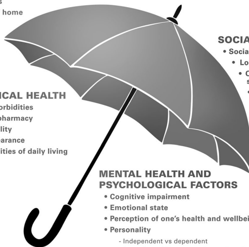
Fig. 2 Components of the frailty umbrella