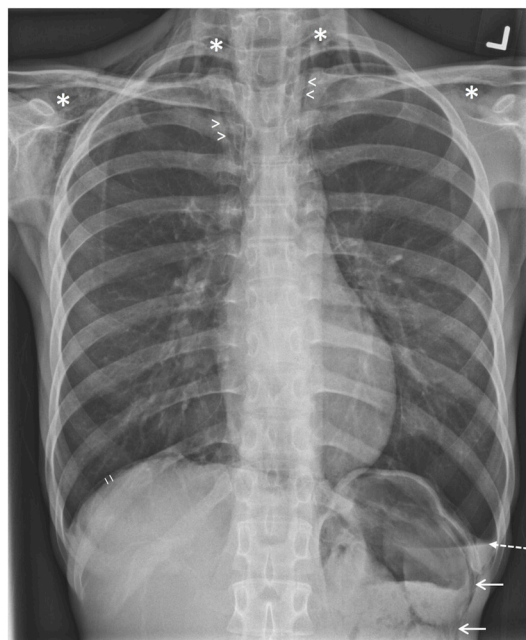
Figure 1 Erect chest radiograph demonstrating a left-sided hydropneumothorax (dashed arrow, with air–fluid level seen), pneumomediastinum (arrowheads), subcutaneous emphysema (asterisk), pneumoperitoneum (short lines) and suggestion of pneumoretroperitoneum (solid arrow). No gross pulmonary lesion was evident.

Spontaneous non-traumatic air leaks outside the airways (ie, pneumothorax, pneumomediastinum, etc) occurring in isolation or in combination, are very rare. In the context of AN, malnourishment has been closely linked to reduced lung surfactant production and emphysematous-like changes which increases susceptibility to tissue injury and poor