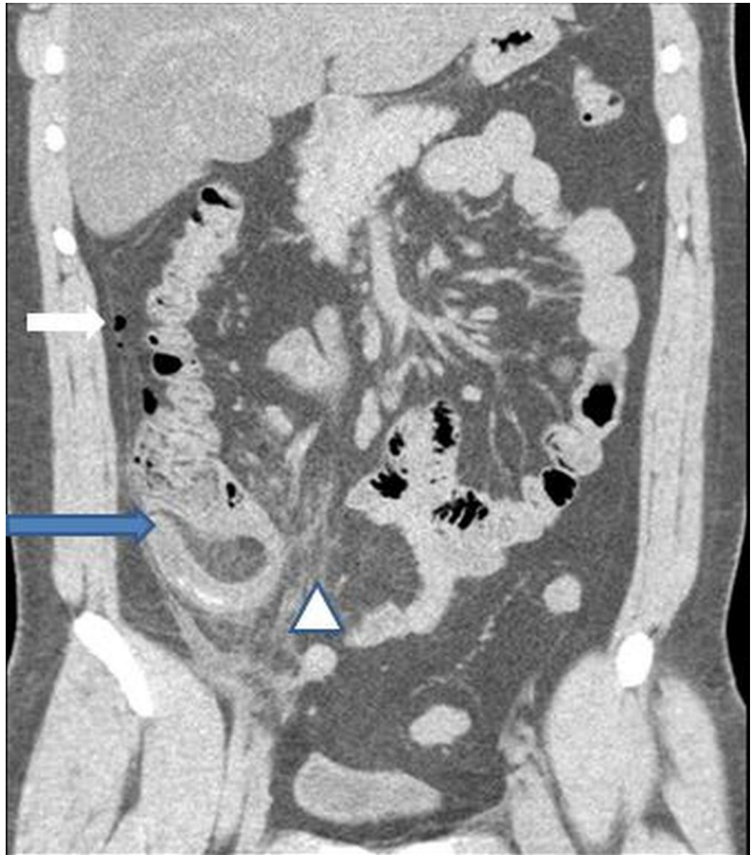
FIGURE 2: Coronal image of abdomen showing swollen appendix (blue arrow) with marked periappendiceal inflammatory fat stranding (arrowhead). Small amount of free air also seen (white arrow)

Specific signs for perforated appendicitis on CT scan included a defect in enhancing the appendiceal wall, focal area of nonenhancement with enhancing of the remaining appendiceal wall, extraluminal air, and extraluminal appendicolith or abscess formation (Figures 2-3).