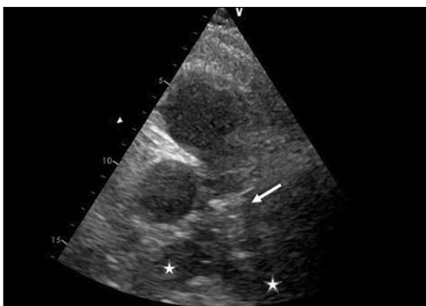
Figure 1. Parasternal short axis view of the pulmonary artery. The stars indicate the right and left pulmonary artery. The white arrow indicates the thrombus lying on the bifurcation of the pulmonary artery.