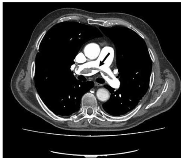
Figure 2. Computed tomography pulmonary angiography (CTPA) demonstrating saddle pulmonary embolism partially obstructing both main pulmonary arteries; the white area above the center is the pulmonary artery, opacified by radiocontrast; the black arrow indicates the pulmonary thrombus.