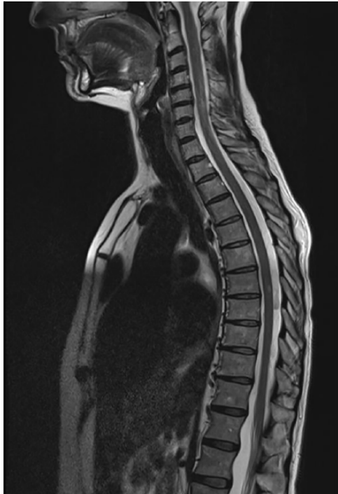
Figure 1. The patient spinal cord MRI showing signal abnormalities in cervical (C2-C6) and thoracic (D6) regions. MRI indicates magnetic resonance imaging.

prior ECG, done a month earlier, showed normal sinus rhythm at 76bpm. Cardiac biomarkers were normal and blood tests showed mild anemia, slight elevation of creatinine (0.95 mg/dL), potassium level of 3.9 mEq/L, sodium level of 141 mEq/L, calcium level of 8.4 mg/dL, and a mild decrease of total protein 5.6 g/dL. A normal left ventricular function was proved with