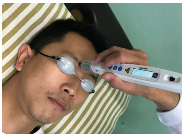
Figure 2. Laser acupuncture performed using the LaserPen device at the BL2 acupoint.

treatment (including Chinese medicine); and those who did not meet the physician's assessment for recruitment or was unwilling to provide informed consent were excluded. In addition, pregnant women were excluded.