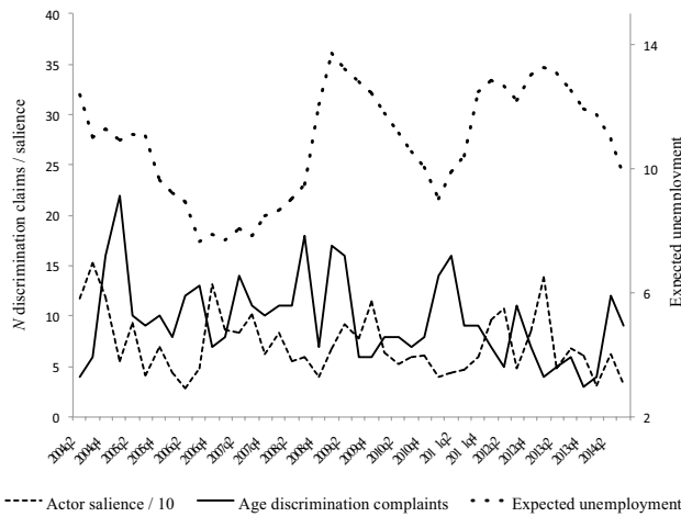
Fig. 1 News media attention for older workers

given the variability of the variable’s series (see Fig. 1); a one SD change in visibility results in a 0.25 change in age discrimination claims. We find support for H1.