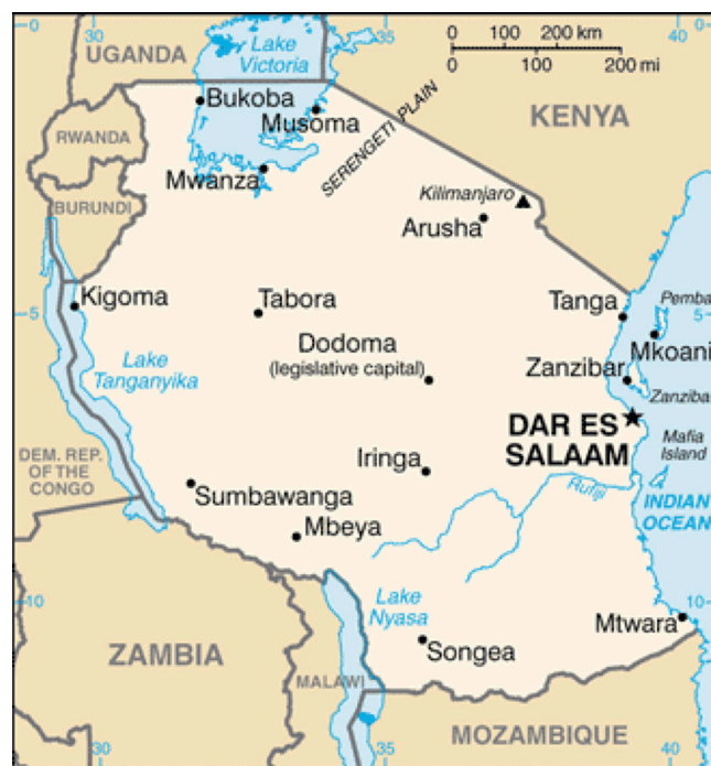
Figure 1 Map of Tanzania 32 showing location of Dar es Salaam.

This paper is based on a qualitative study embedded in a randomised trial called Connected2Care (NCT02509702). The trial aims to assess the effect of short message service (SMS) on attendance at a health-provider initiated cervical cancer follow-up screening among women, who have tested HPV-positive during a patient-initiated screening. Both the patient-initiated and health provider-initiated screening entailed a gynaecological examination. The trial started in 2015 and is to finish in 2018. The study protocol is published elsewhere. 9