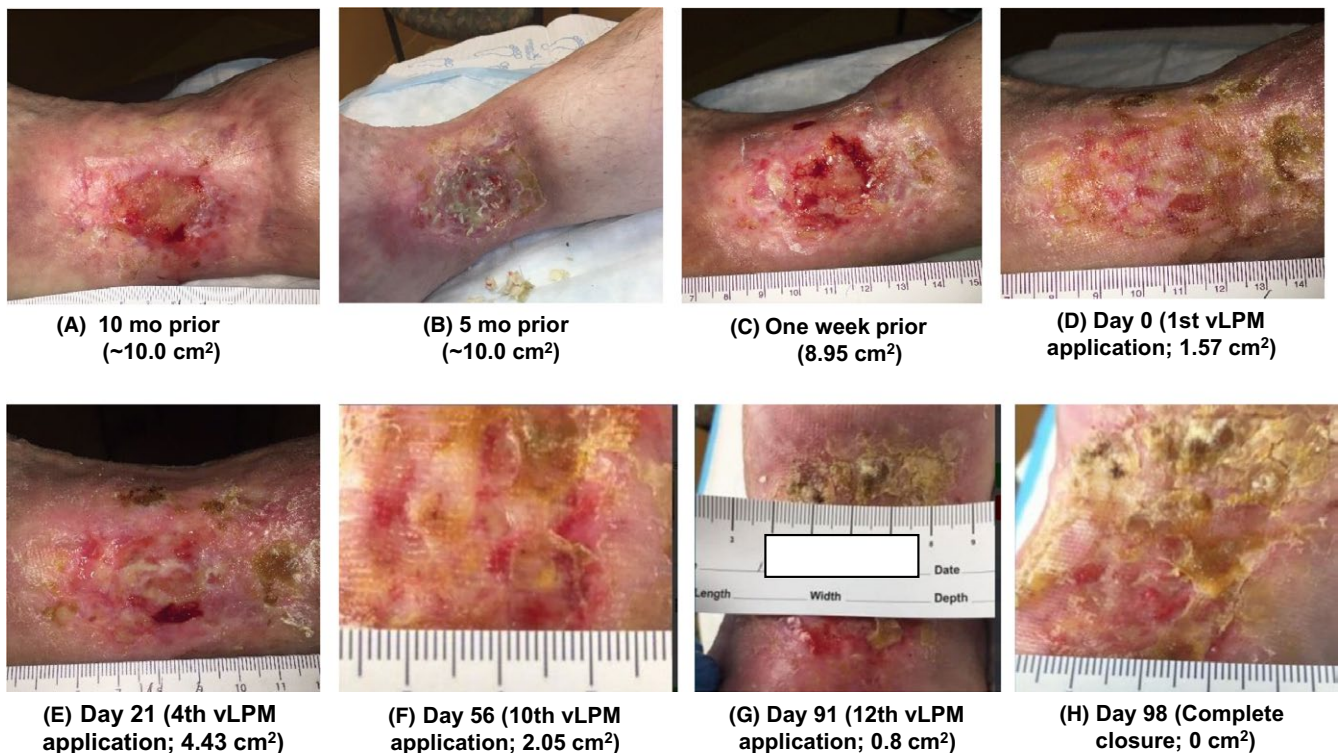
FIGURE 1 (A-H) Progression of the wound 10 mo prior to vLPM treatment until complete closure at day 98

In the current study, we evaluated vLPM in the treatment of a chronic radiation necrosis wound that resulted from squamous cell carcinoma radiation therapy, post-surgical tumor excision in a patient with multiple comorbidities. Radiation triggers cell death and impairs cell functionality including migration, proliferation, differentiation, and secretion of extracellular matrix proteins and growth factors. Radiation directly damages fibroblasts causing a decrease in collagen production and loss of collagen function. 1 Further, the presence of reactive oxygen species can lead to the dysregulated production of myofibroblasts, causing an abnormal production of collagen. This is referred to as radiation-induced fibrosis, which prevents wound healing as it inhibits inflammatory cells and impairs angiogenesis, both of which are required to