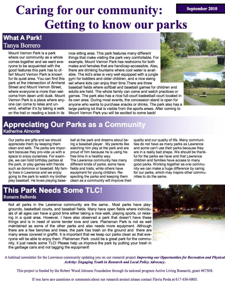
Figure 2. Newsletter: Caring for our Community.

Print copies in both languages were made available to the public throughout the city including at the Public Library, City Hall, and a local employment agency. They were also disseminated locally electronically through the MHTF listserv as well as through stakeholder networks. To increase visibility of the project in the wider Boston area, the newsletters were also electronically disseminated through resources at Tufts University. By using these mechanisms, it was possible to reach a wider audience comprised of both researchers, lay people, and community organizations engaged with academic institutions in the Boston area.