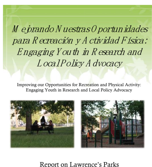
Figure 4. Cover page of final Report on Lawrence's Parks [46].

The report, the cover of which is presented in Figure 4, was disseminated throughout the city, in particular to key stakeholders such as the MHTF, mayor, city council members, local department heads, and non-profits involved in health and environmental issues. The report was also made available online and disseminated electronically through the same channels as the newsletter.