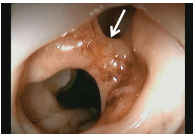
Fig. 2 Endoscopic view of the mucosal bridge (white arrow) at the level of the gastroesophageal anastomosis.

Mucosal bridge is a very rare condition and the etiology is still unclear. It can form after an anastomosis, perhaps due to injury from indwelling catheters, contained leaks, gastroesophageal reflux disease, inflammation, esophageal dysmotility, or a combination of the above. 1 The mucosal