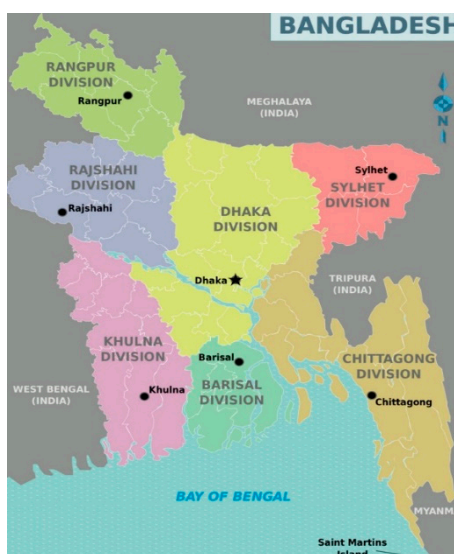
Figure 1. A map of Bangladesh showing seven administrative divisions [21].

small-scale community-based studies have been undertaken with regard to DBM, and no nationwide studies have been undertaken [20].