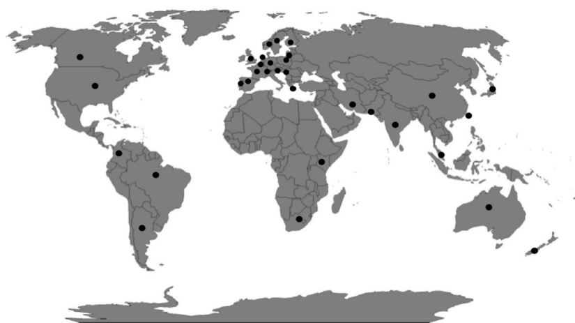
Figure 2. Countries’ distribution of the 39 selected studies.

Study quality was reported in Supplemental Tables S1 and S2. The risk of bias was relatively high because (1) exclusion and inclusion criteria were not always clear; (2) some of the studies were not