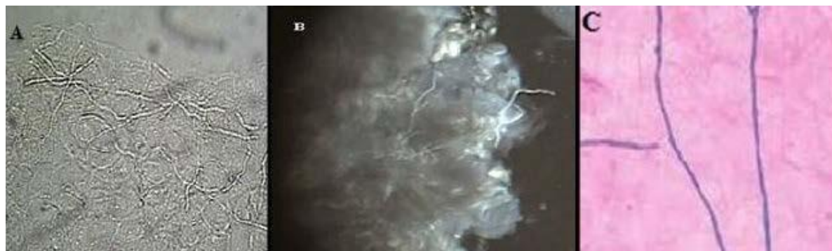
Fig. 2. Fungal elements in skin scraping stained at \times 40 magnification; A: KOH, B: CFW-KOH, C: CSB-KOH

Consuming materials' safety information. Safety information sheets contain details on the composition, safety, handling, storage, disposal, and transportation of materials, and other regulatory information. They are routinely used in performing risk assessments for chemicals or other products used in the operating environment, in compliance with CSSH (Control of Substances Hazardous to Health) regulations (10). According to safety information, CSB, CFW, and KOH are reported to have a corrosive effect on metals and skin and to seriously damage the eyes or respiratory tract. Therefore, it is recommended to use protective gloves, eye shield, and dust respirator filter during handling and working with the material. However, low concentrations were used in this study, which is unlikely to cause any significant problems.