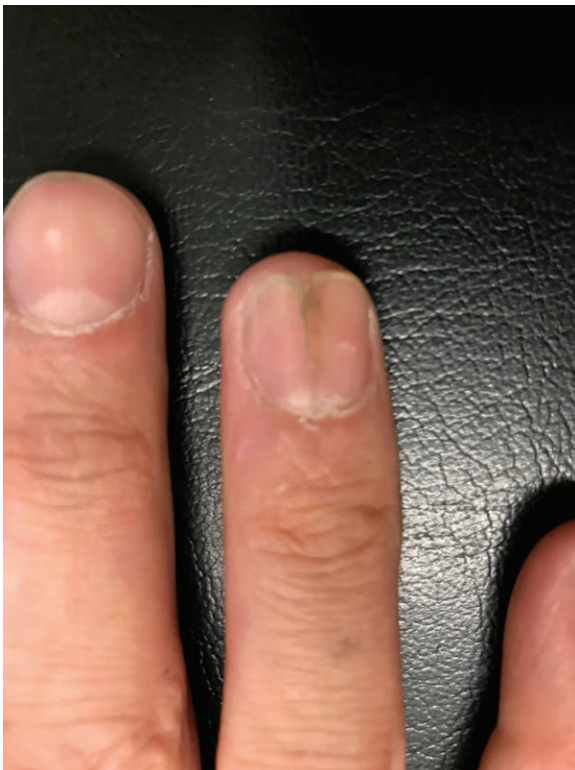
Fig. 3. Image of the right ring finger at 6-month follow-up examination.

In general, subungual glomus tumors are a rare occurrence. 1 Moreover, cutaneous myxoma of the subungual space is an even more uncommon entity. Only 4 cases of myxoma involving the fingertip and 2 involving the palm