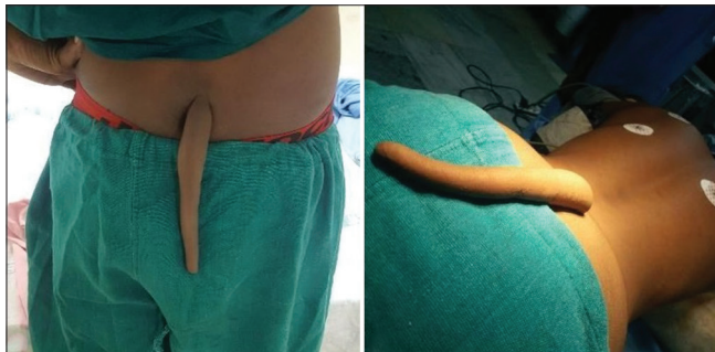
Figure 1: Preoperative images of 18-cm long human tail in the sacral region

The occurrence of tails in humans continues to be a rare and fascinating phenomenon. There is a wide variation in social status attributed to tailed humans. For most people, having a tail is a reason for fear, shame, and surprise and is considered a curse, while for some people, it is regarded as a symbol of status. In case of the Ranas of Porbunder in India, rulers of Rajput tribes, a tail was considered a