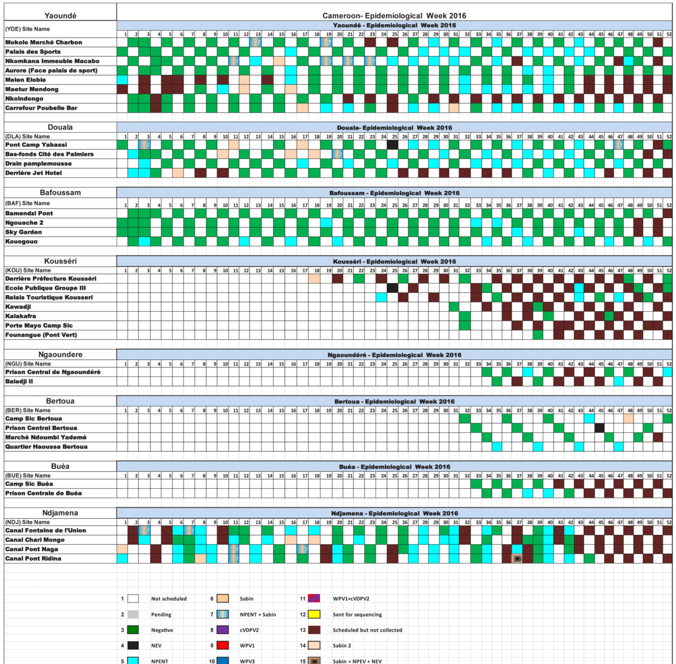
Figure 4. Environmental results for Cameroon