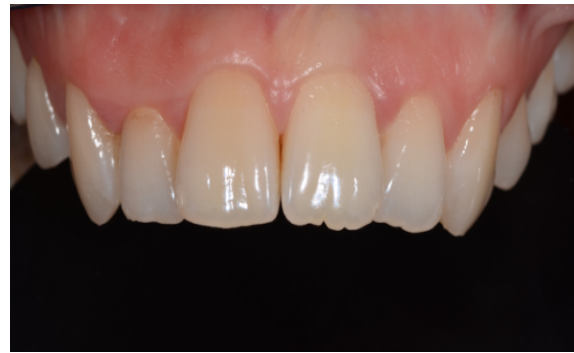
Fig.1. Clinical aspect of the maxillary arch

Starting with 2017, Cerec software 4.5 came with several new functions. One of the new features available with the new version of the software is Shade Detection, which allows color detection of dental structures. It manages to detect dental color, and the results are expressed in color codes corresponding to Vitapan Classical (VC) and Vitapan 3D Masters (V3DM) shade tabs, Vita, Germany (Fig.1,2,3).