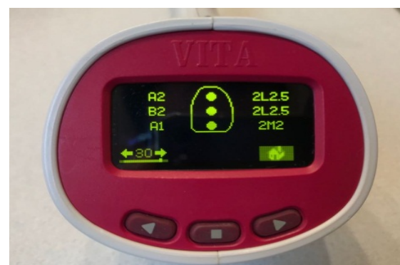
Fig.4. Vita EasyShade measurements-Tooth Area mode