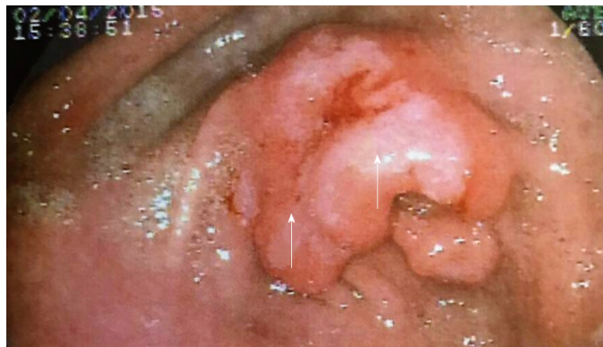
Figure 2 Pre-pyloric gastric ulcer in a patient with Crohn's disease.

respectively [68] . This endoscopic aspect is also described in patients with the disease in remission [69] .