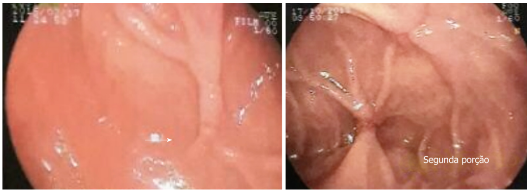
Figure 3 Duodenal involvement in a patient with Crohn's disease and Helicobacter pylori negative.