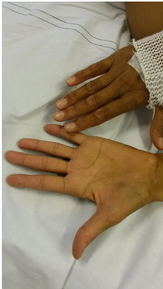
Figure 1 Skin hyperpigmentation of a Caucasian female.

Hyponatraemia is a common electrolyte disturbance with multiple causes. We present a case of a 49-year-old Caucasian female with cholangiocarcinoma, who had a hyponatraemia which was initially assumed to be based on a syndrome of inappropriate antidiuretic hormone secretion as paraneoplastic phenomenon. At physical examination, hyperpigmentation was seen and multiple episodes with syncope were reported. Subsequent endocrine assessment with a synthetic adrenocorticotropic hormone (ACTH) stimulation test and measurement of ACTH levels revealed primary adrenal insufficiency also known as Morbus Addison. We started hydrocortisone and fludrocortisone replacement therapy, resulting in resolving of symptoms, hyponatraemia and hyperpigmentation.