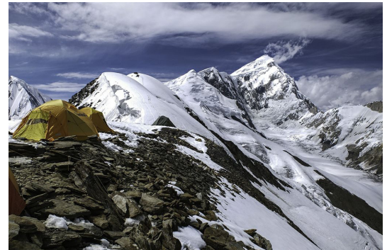
Figure 2 Picture showing Spantik, in the Pakistani Karakorum.

A wide variety of nail changes are associated with high altitude mountaineering and have been attributed to a reduction in iron stores, local trauma, cold exposure, the side effects of medications taken at altitude and a hypobaric environment. 3-5 By definition, extreme altitude was reached at 6900 m, where the inspired PaO 2 of oxygen is about 39% compared with sea level. 6 There are also significant metabolic adaptations at such heights with augmentation of basal metabolic rate, decreased oxygen in peripheral metabolic tissues, reduction in maximal ventilation, increased glucose dependency and lactate accumulation during exercise. Any effort requires more energy and weight loss is extremely common. 7