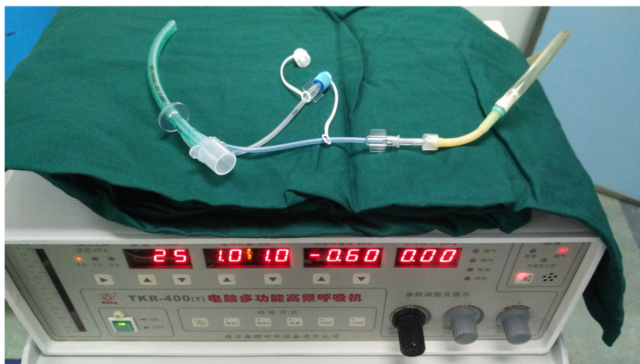
Fig. 1 Components and assembly of the WEI Nasal Jet Tube (WNJ) and automatical jet ventilator: P et CO 2 = end tidal CO 2 pressure (Compliance with ethical standards: The automatical jet ventilator-TKR-400 and WNJT upon examination and approval by the company, pictures can be used)

According to the world health organization (WHO) standards established 1989, body mass index (BMI) ≥28