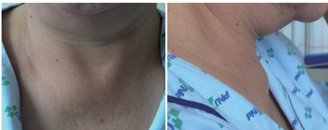
Fig. 2. Diffuse enlargement of thyroid was detected on physical examination.