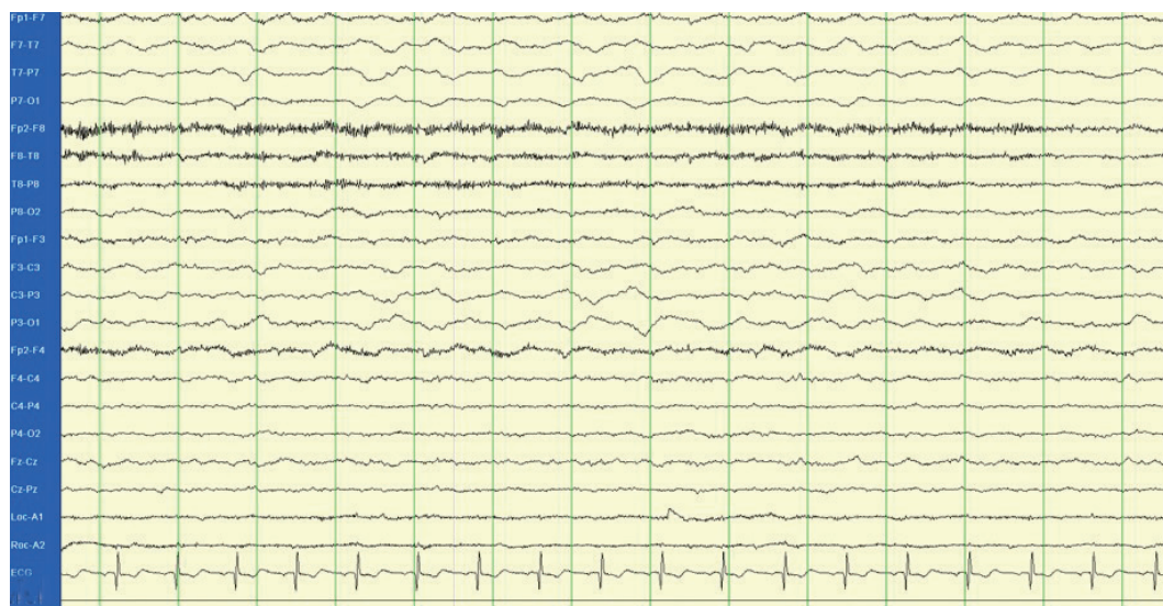
Fig. 3. The electroencephalography showed intermittent 2–3 Hz delta background activity in the left hemisphere, suggesting moderate cerebral dysfunction on the left hemisphere.