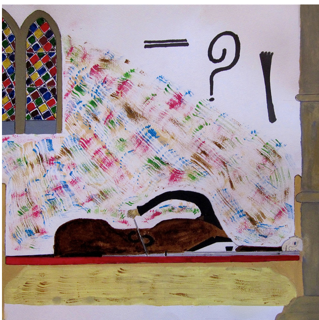
Figure 2 Painting by MDBD.

The rationale of HoS is to provide a safe space through the medium of arts in which group members have the opportunity to reconnect with their internal selves