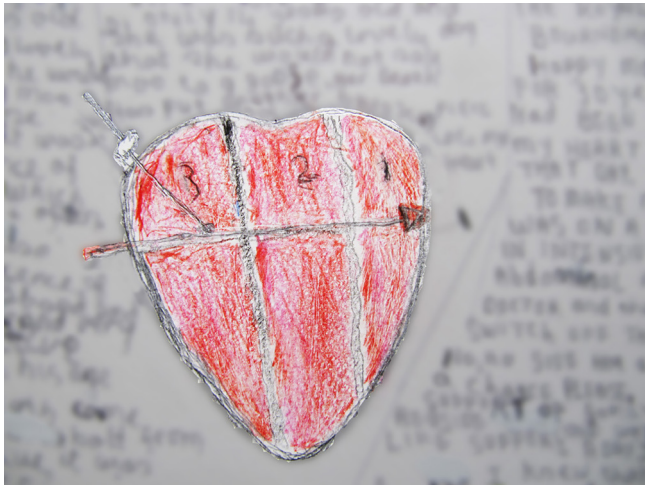
Figure 1 Drawing by FB.

materials, clay, textiles and mixed-media) in response to the group members' individual and collective creative interests and skills. The group was offered 'stimulus' pieces such as books, poems, images, music and film, and members were encouraged to share their own pieces of interest with the group.