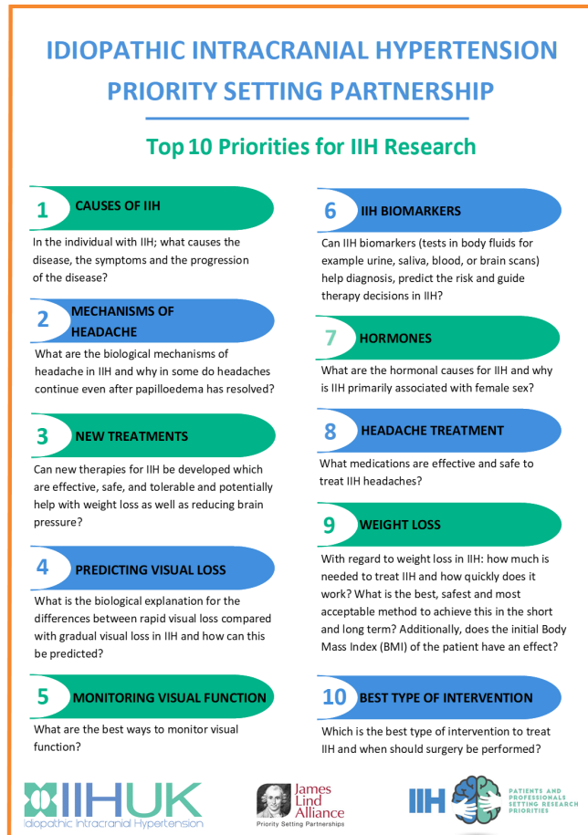
Figure 2 Final top 10 ranked uncertainties for concerning the treatment and management of people with idiopathic intracranial hypertension (IIH).

group members. All responses were refined to understandable ‘uncertainties’ with the exception of those considered to be ‘out of scope’. These were categorised using the UK Clinical Research Collaboration Health Research Classification System, sorted into themes and then formulated into indicative questions by steering group members, working in groups with at least one HCP and one patient representative. A literature search was conducted with the electronic databases, CENTRAL, Embase and MEDLINE, searched from inception to March 2018 for systematic reviews using strategies based on those used by Piper et al. 2 The ‘known knowns’ with reference to the appropriate literature and duplicate questions were removed. Questions were amalgamated when practical to do so. The long list was then verified by the PSP lead and discussions were held with the wider steering group if disagreements occurred.