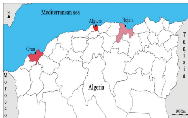
Figure-1: Geographical location of the Algerian area where the fish's samples were collected.

Sample preparation was performed to reduce the risk of any exogenous contamination; samples were quickly prepared after their arrival in the laboratory in compliance with two European standards: EN 13804 (2013) and EN 13805 (2002). Fishes were rinsed with tap water then distilled water.