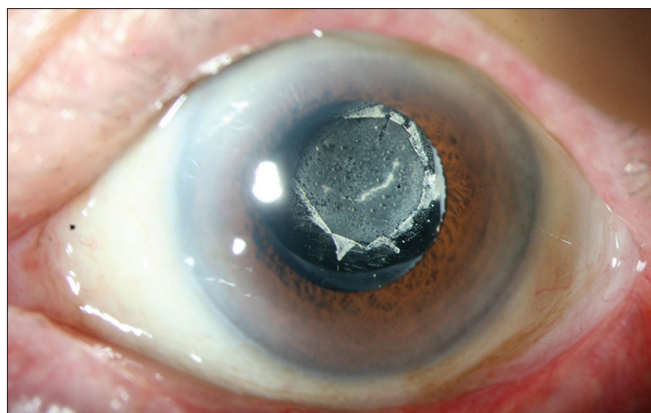
Figure 1: Anterior segment examination of the left eye showed white-gray membranous deposit on the posterior surface of the silicone intraocular lens occluding the posterior capsular opening

Although this phenomenon appears to occur in association with silicone IOL, it is unclear why only a few cases develop IOL opacification despite the large number of silicone IOLs that have been implanted in patients with asteroid hyalosis. [6] We believe further