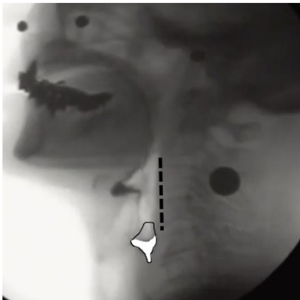
Figure 3 Example of pixel-based measurement of pharyngeal residue in the piriform sinus.

In this study, tongue function was divided into two categories: strength and dexterity. Tongue strength was defined as the maximum TP measured using a JMS tongue pressure