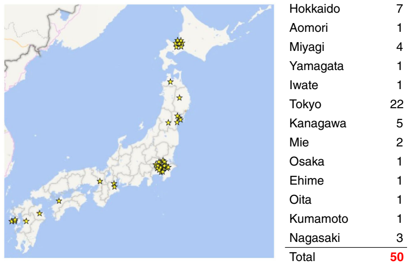
Fig. 1 Number of participating institutions by location (prefecture)

and non-fatal cerebral infarction) and bleeding events (major bleeding based on TIMI criteria); individual components of ischemic events; all-cause death; stent thrombosis; major and minor bleeding based on TIMI criteria; type 2, 3, or type 5 bleeding based on the BARC criteria; and hospital readmission due to heart failure. Stent thrombosis was defined as definite or probable stent thrombosis according to the Academic Research Consortium definition [30].