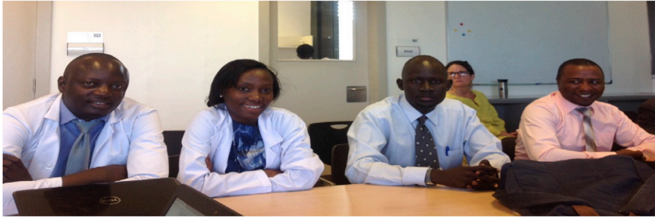
Figure 1. The first 4 PHO Fellows in the East Africa Pediatric Hematology-Oncology Training Program.