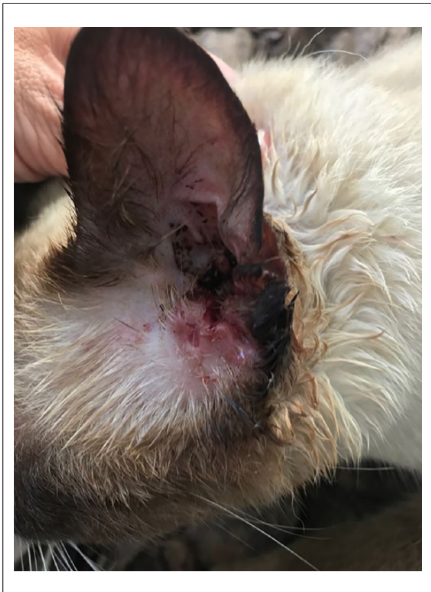
Figure 1 External meatus of the cat with ulceration, erythema and a dark secretion

After the cytopathological examination revealed the presence of yeast-like structures, an oral antifungal